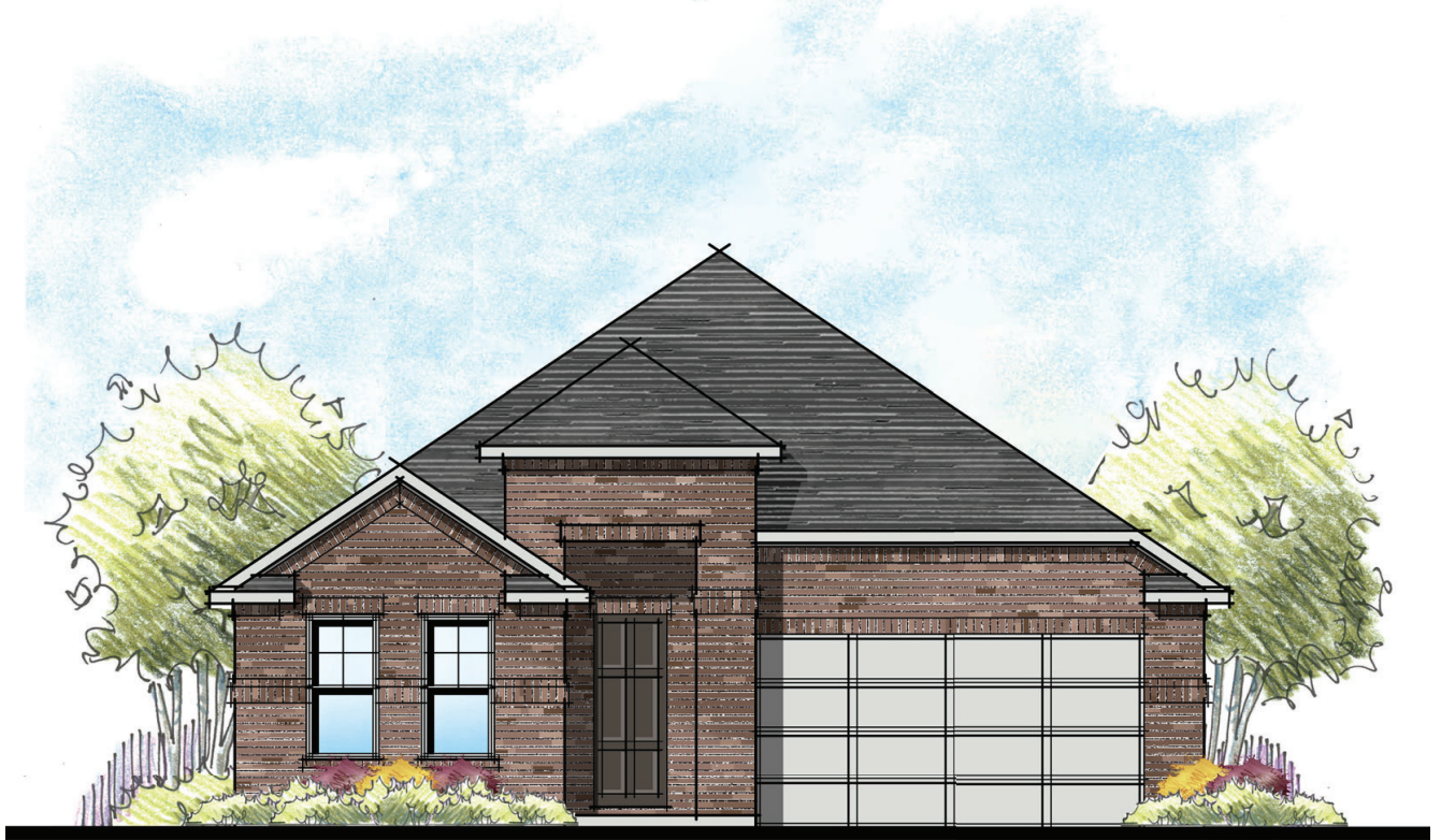
LILY (A) - 2,179 SF