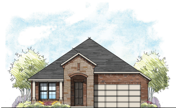
LILY (B) - 2,179 SF